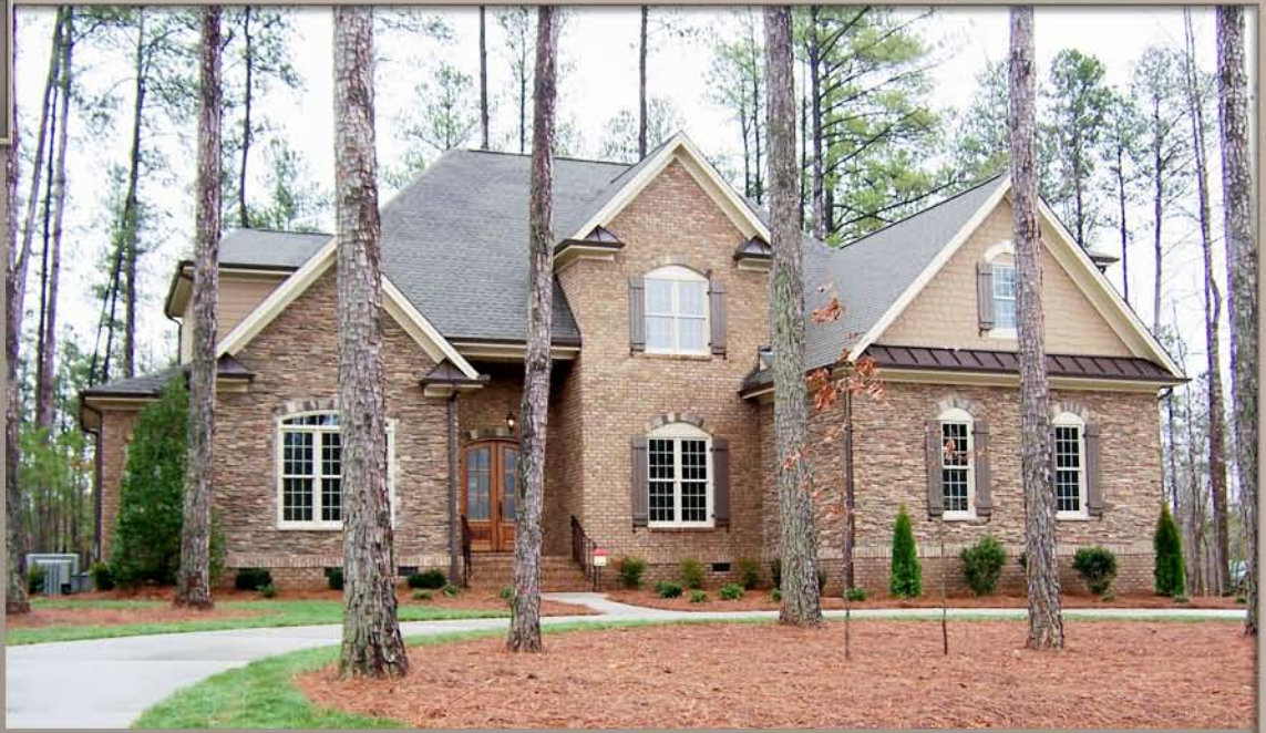
Homesite 10 12232 The Gates Drive